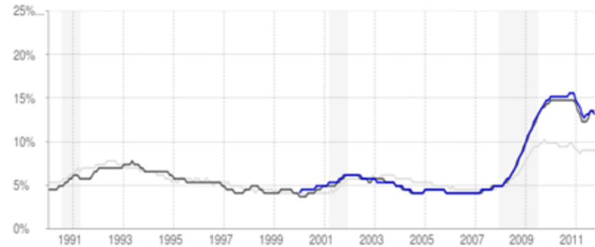
Unemployment Rate: Las Vegas, Nevada, National